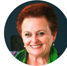
ヤッファ・ベンアリ 駐日イスラエル大使 Yaffa Ben-Ari Ambassador, Embassy of Israel in Japan www.israel-japan.org