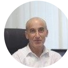
Michael Lotem Director, Economic Department, Asia, CIS, Israel Ministry of Foreign Affairs https://mfa.gov.il/ Development of economic and trade relations with countries in these regions through different tools, such as: Bilateral agreement, connecting companies, market research, opening new areas of activities

1988年東京大学教養学部教養学科(国際関係論)卒業、東京銀行(現・三菱UFJ銀行)入行。 世界銀行コンサルタント、通商産業省通商産業研究所(現・経済産業省経済産業研究所)客員研究員、米コロンビア大学ビジネススクール日本経済経営研究所助手、カナダ・サスカチュワン大学ビジネススクール助教授、立命館大学経営学部准教授を経て、2011年から現職。米コロンビア大学大学院でPh.D.(経済学)を取得。専門はファイナンス全般、特にベンチャーキャピタル、イノベーションのためのファイナンスなど。